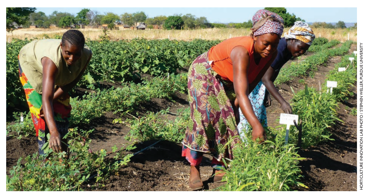
Farmers with the Nsongwe Women's Association in Zambia tend to a field of vegetables, including spiderplant, as part of a Horticulture Innovation Lab project in Zambia, Kenya and Tanzania.