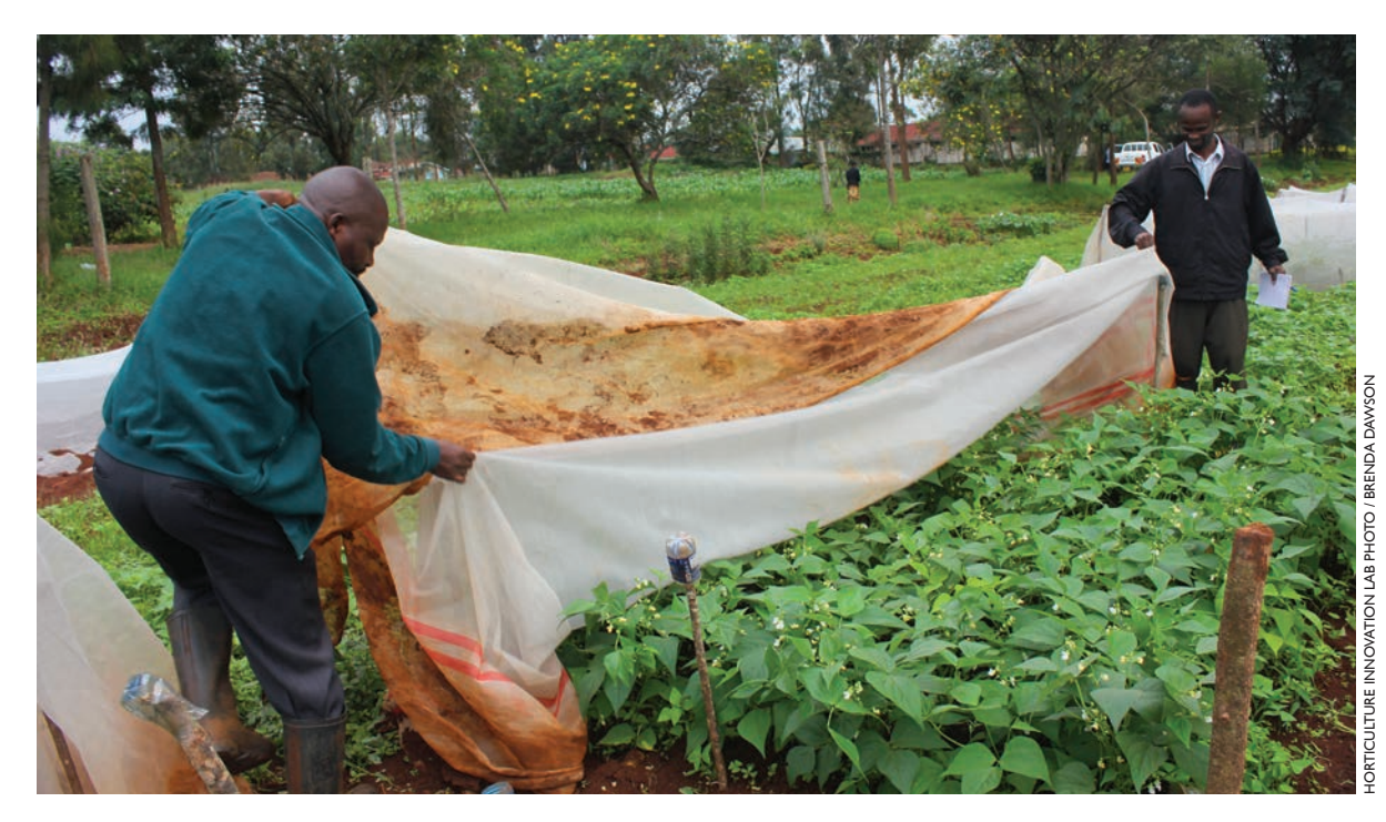
Workers with the Kenya Agricultural Research Institute check on vegetables in AgroNet field trails at KARI Kabete, during a project with the Horticulture Innovation Lab.