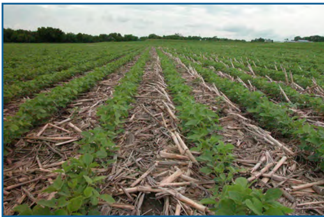
Beans growing in crop residues Nebraska, USA, 2007