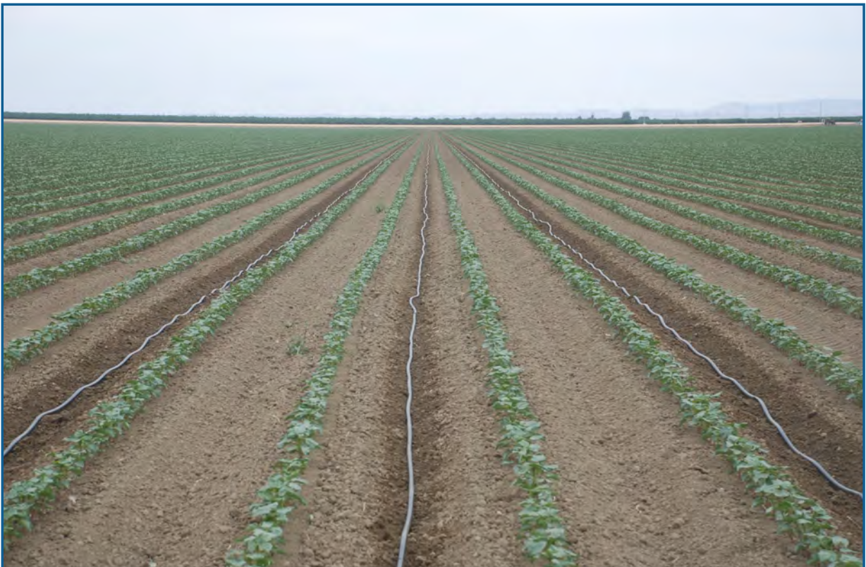
Wetting pattern of drip tape