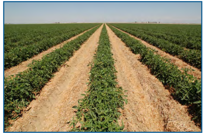
Tomatoes growing in cover crop residue California, USA, 2008