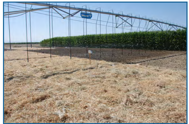
Measuring soil water evaporation under residues and bare soil California, USA, 2009