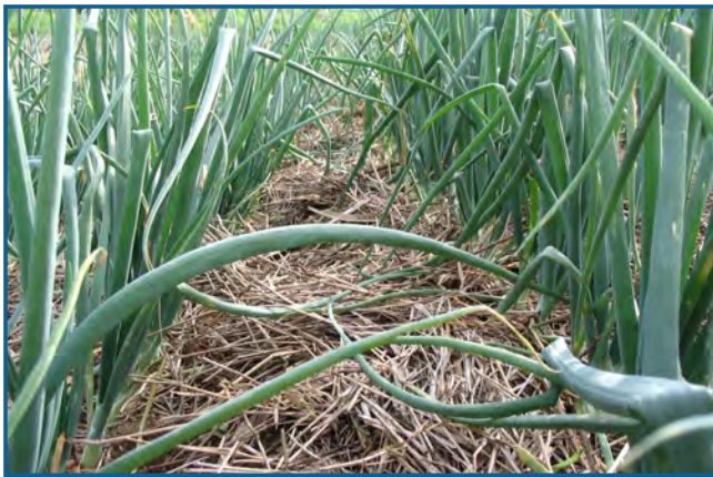
Onions growing in crop residue Brazil, 2005

Estimates of water savings due to reduced tillage and surface residues have been determined to be upwards of 10 cm during a crop season in the US.