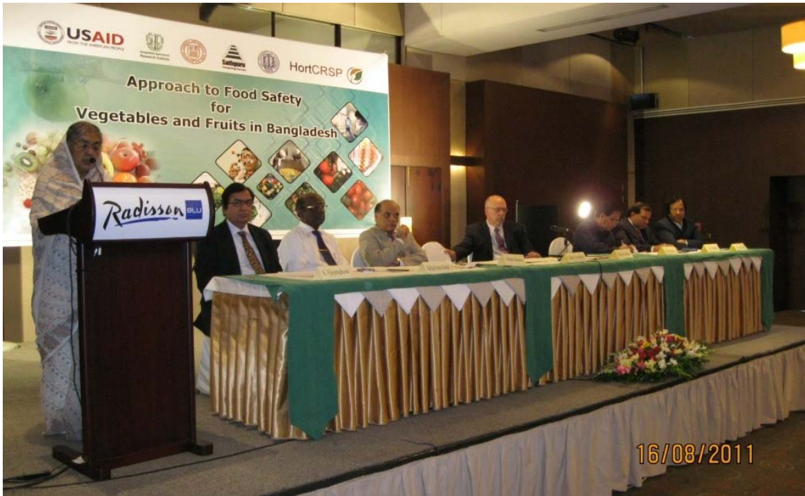
Begum Matia Chowdhury, Hon'ble Minister, Ministry of Agriculture, Government of Bangladesh and Chief Guest at the workshop addressing the participants at the workshop