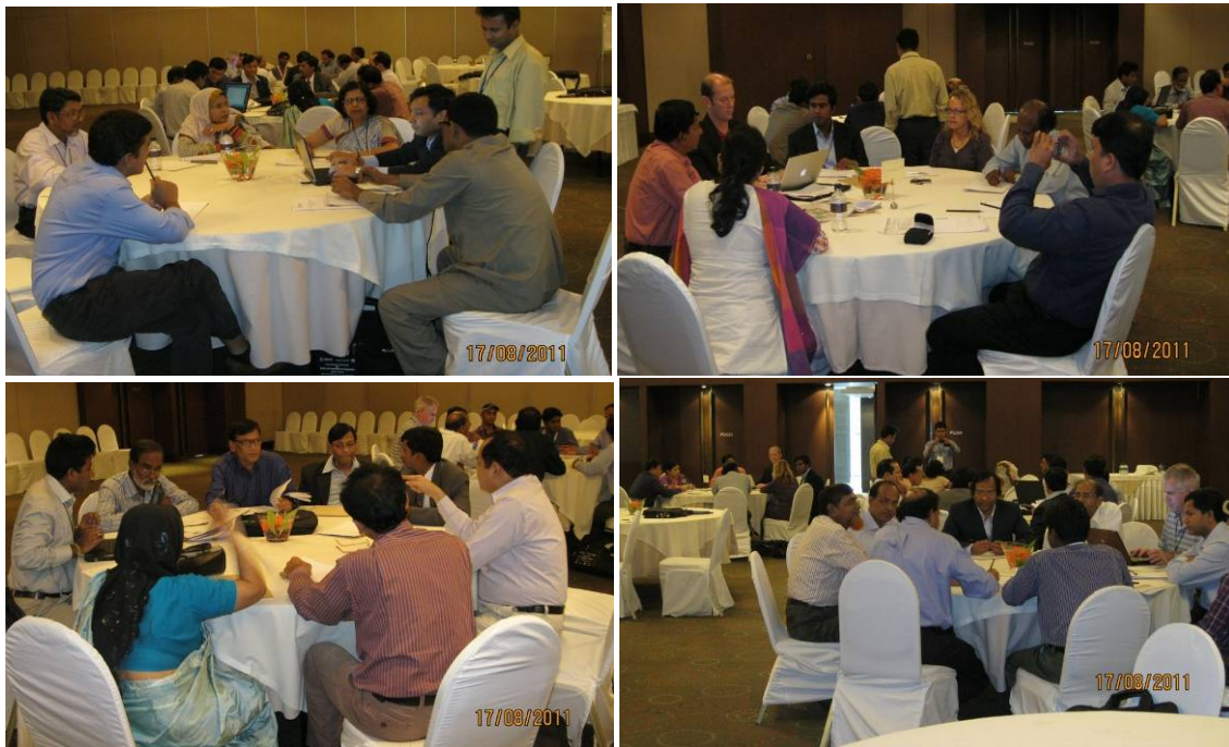
Participants and faculty participating in focused group discussions to develop action plan for the pilot project