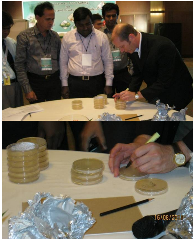
A participatory exercise to demonstrate to the participants the common levels of microbial contamination on their own hands and the importance of washing hands properly