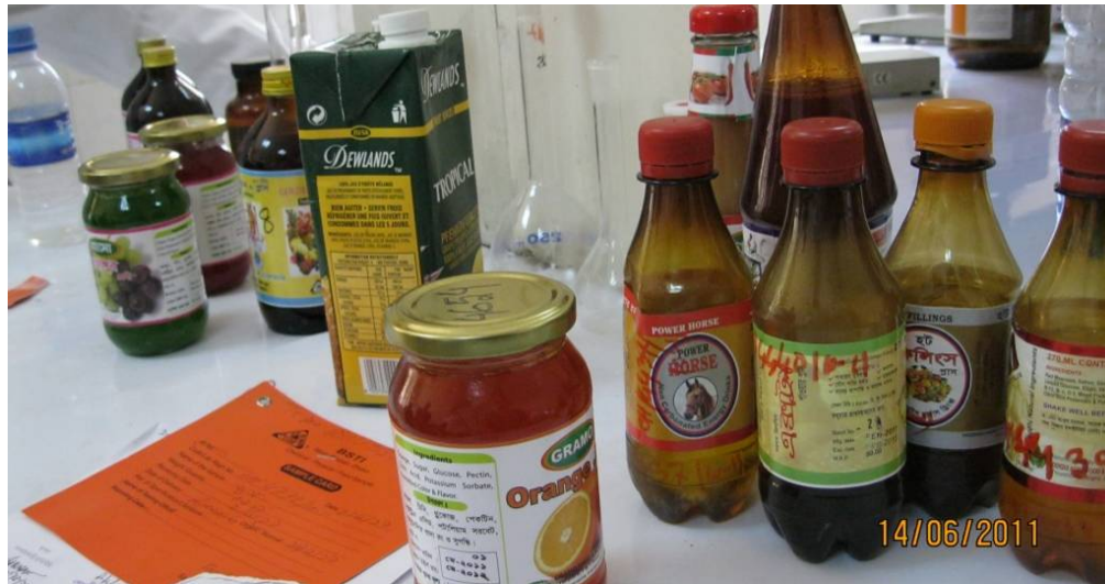
Food Testing Laboratory (Processed Fruit Products and Fruit Drinks Section)