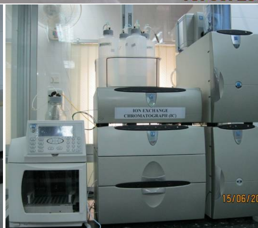
Food Safety Laboratory