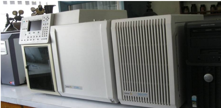
Laboratory for Electrochemical Technologies at AEC