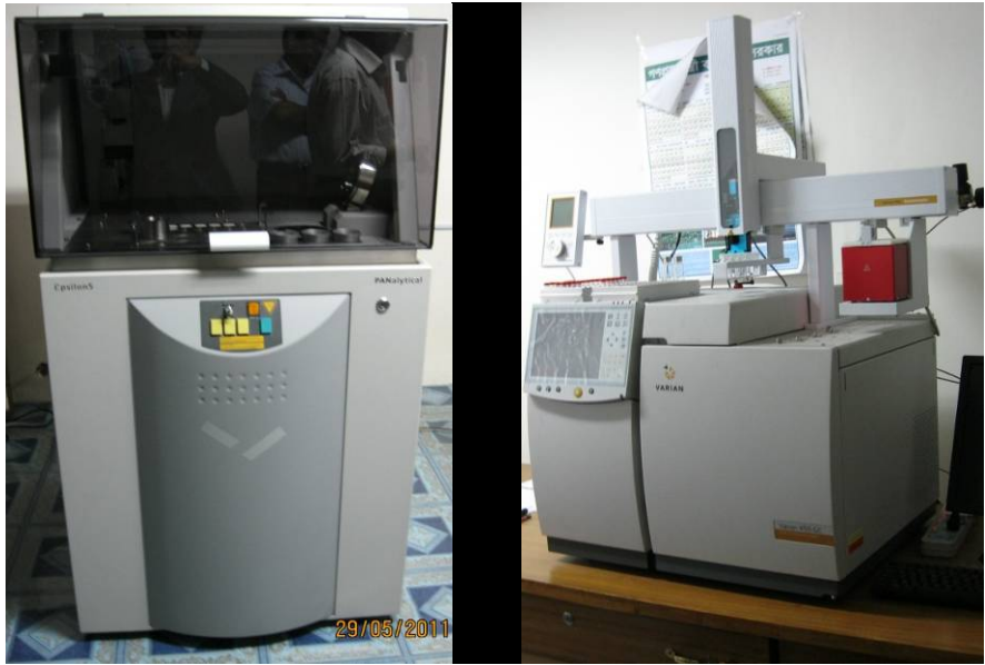
XRF Laboratory at AEC