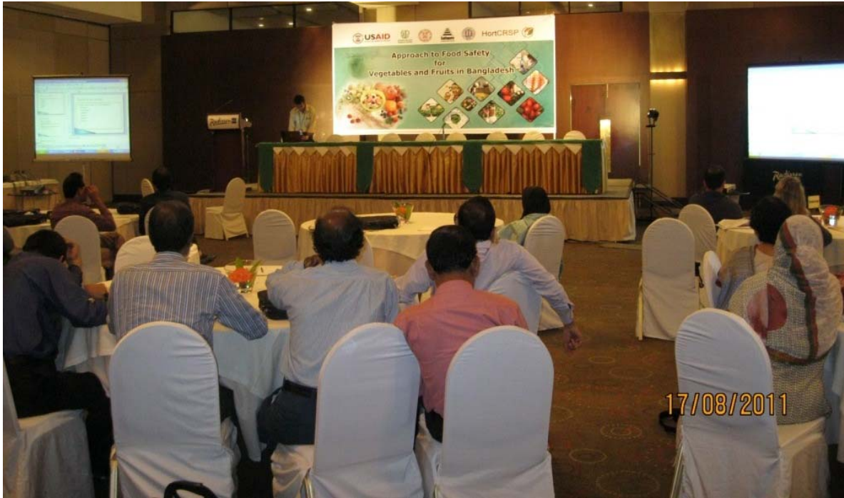
A participant presenting the action plan developed through the focused group discussion