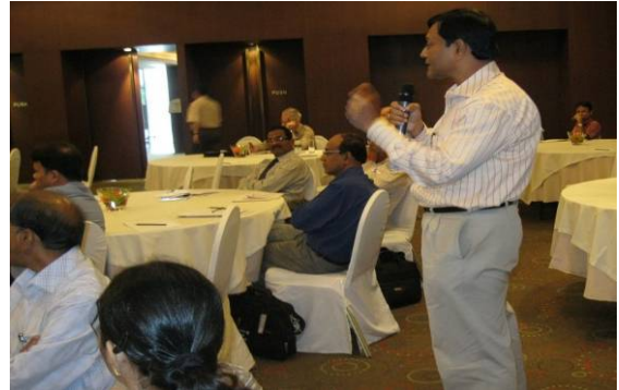
Participants engaging in discussions after a technical session at the workshop