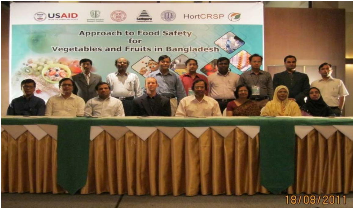
HortCRSP and BARI team on the last day of the August 2011 workshop