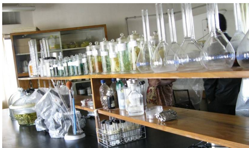
Plant Pathology Lab, HRC, BARI