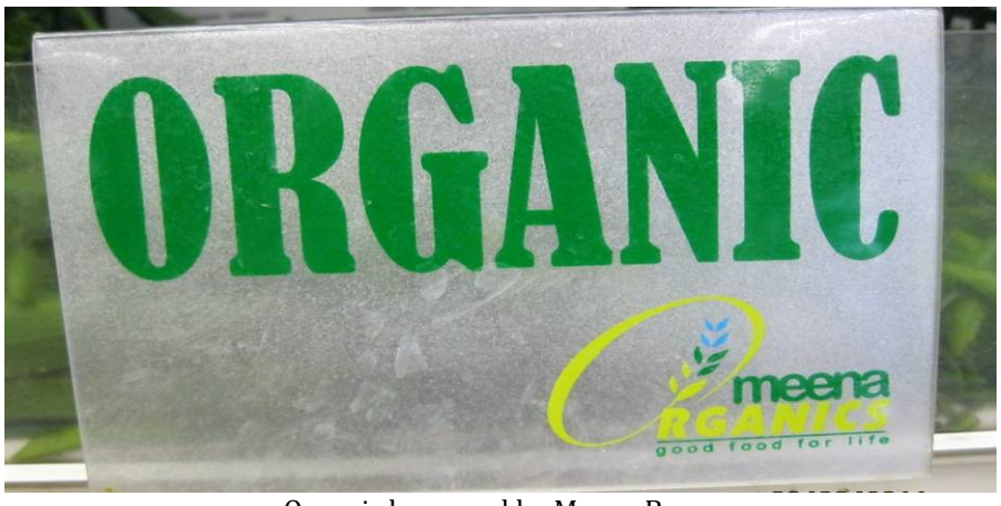
Organic logo used by Meena Bazar