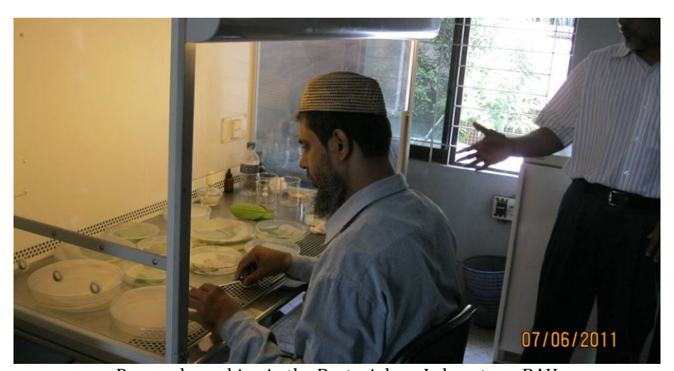
Research working in the Bacteriology Laboratory, BAU