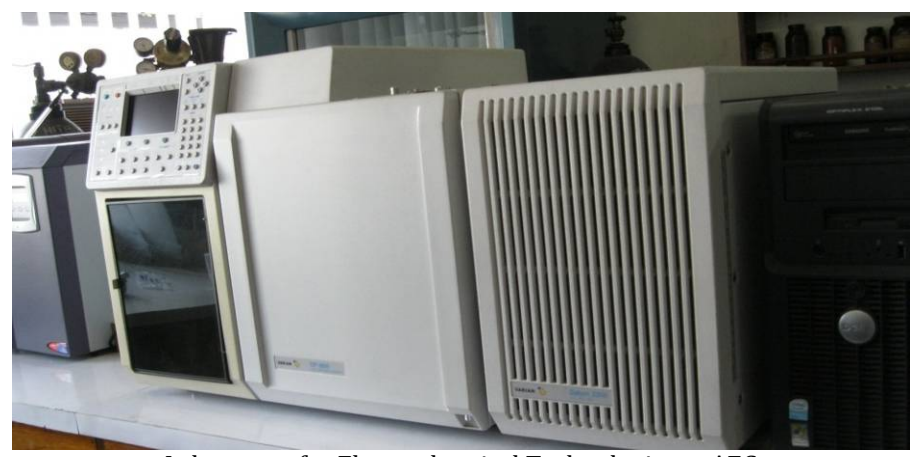
Laboratory for Electrochemical Technologies at AEC