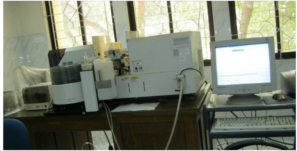
Chemistry Laboratory (used for heavy metal residue detection)