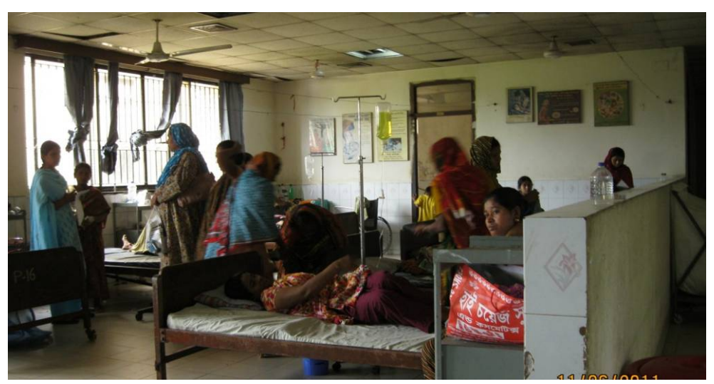
Gynecology ward at ICMH