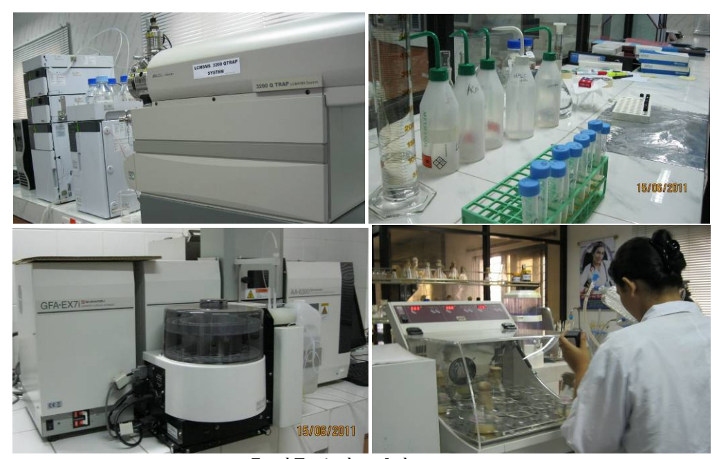
Food Toxicology Laboratory