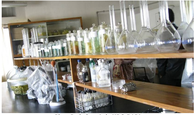
Plant Pathology Lab, HRC, BARI