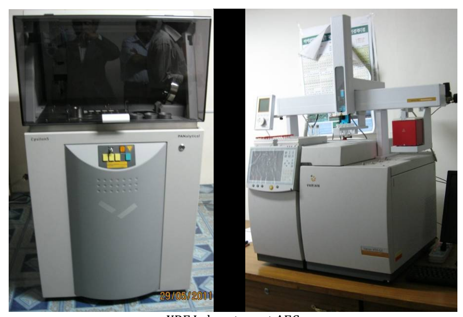
XRF Laboratory at AEC