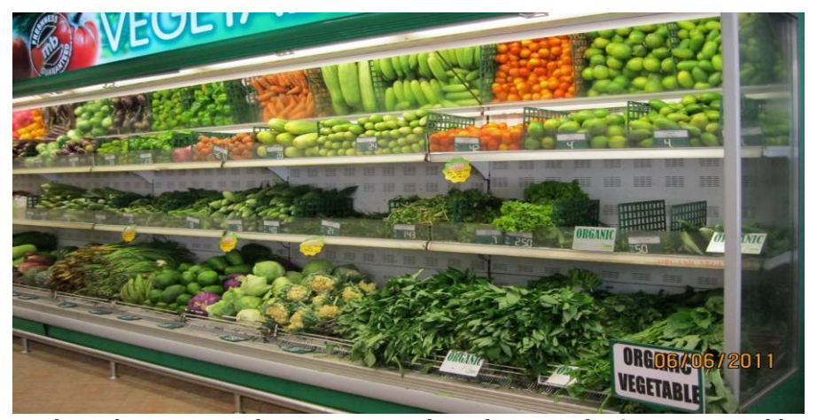
Fresh produce section of MeenaBazar with a sub section for Organic vegetables