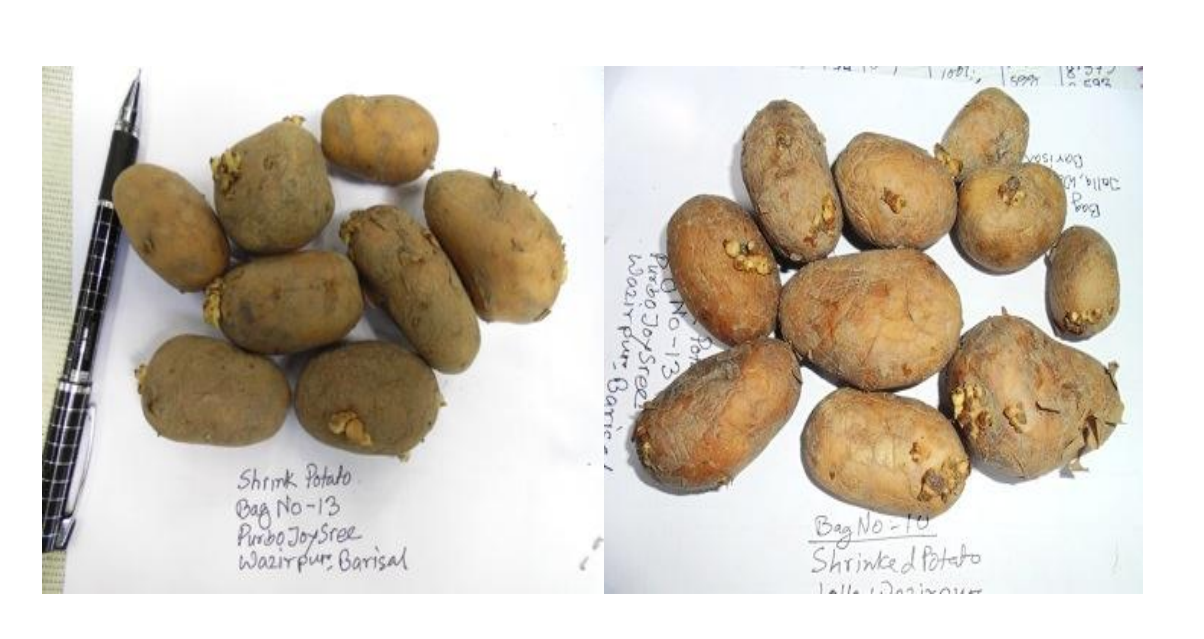
Cool storage for 3 months