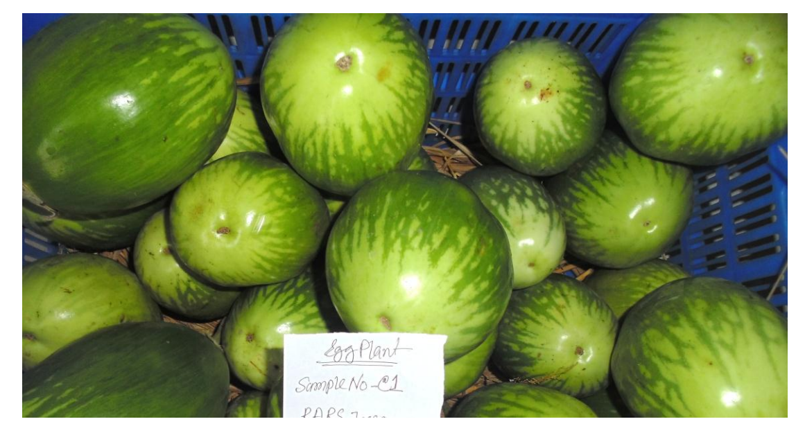
Ambient-stored eggplant 15 days

Storage of cool season and warm season vegetables Coolbot-stored eggplant 15 days