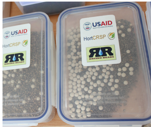
Left: Vegetable seed drying with drying beads in airtight containers.

preserving seed quality. The beads can be regenerated in an oven for repeated use.