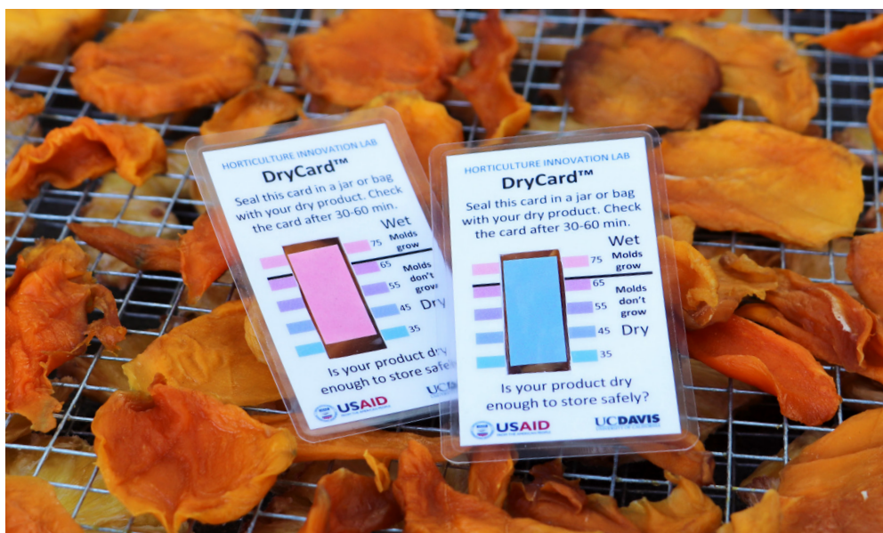
By combining a strip of cobalt chloride paper with a color index, the DryCard indicates by color whether dried foods are dry enough to store safely, reducing the risk of mold growth.

In March, the DryCard was selected as a top emerging technology for improving postharvest practices in Africa — beating more than 200 technologies to win the