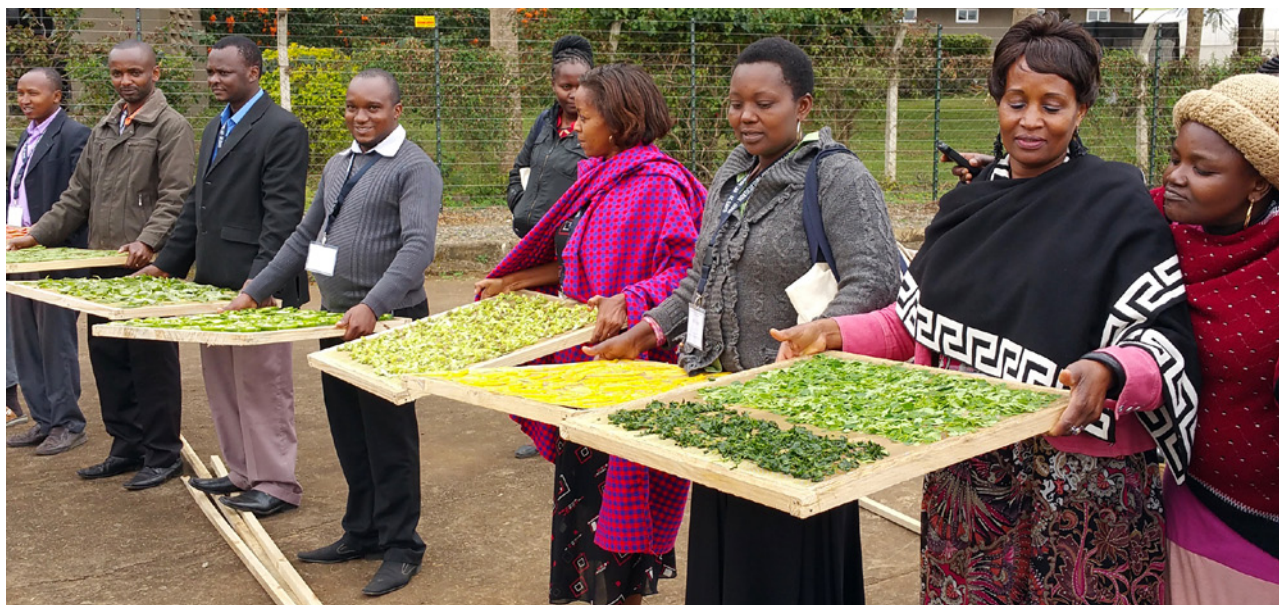
Training participants prepared a variety of fruits and vegetables on trays for the chimney solar dryer they built as part of the postharvest short course.