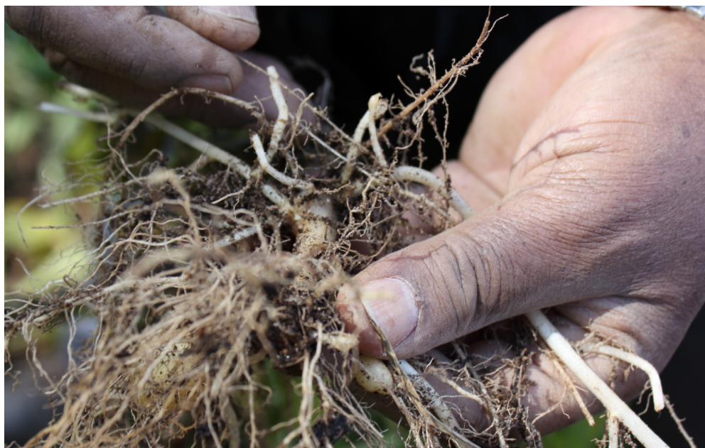
Potato cyst nematodes thrive in depleted soil and are blamed for major reductions in potato yield in Guatemala's Western Highlands. After analyzing farmer perceptions, researchers recommend they use chicken litter compost and biopesticides to reduce this pest pressure among potatoes.

“Cognitive mapping helps us understand how the community is thinking, to tailor our workshops and teaching so that we