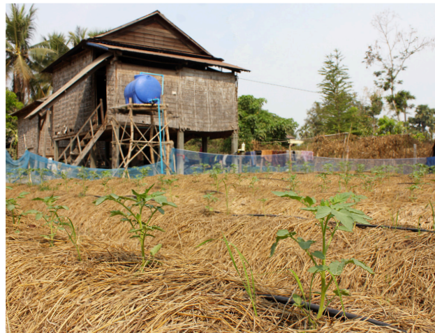
When combining drip irrigation with conservation agriculture to grow vegetables such as these tomatoes on small plots, the drip irrigation tape is installed beneath the mulch layer.

Combining these practices with drip irrigation improves water use efficiency, delivering water more directly to the crop roots and decreasing surface evaporation. Drip irrigation works well with conservation agriculture because the mulch layer reduces the need for weeding, thus reducing potential inconvenience and damage to the irrigation equipment. Field trials have found that the combination of conservation agriculture and drip irrigation can mitigate the temporary yield reductions which are often seen upon first adopting conservation agriculture practices.