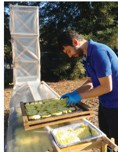
Designed by UC Davis researchers for the Horticulture Innovation Lab, the chimney solar dryer combines solar heat collection with rapid air flow for efficient drying of fresh produce.

Materials can be purchased for less than $150; however, costs are subject to local variation.